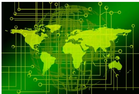
Figure 2: (Calibri 7)